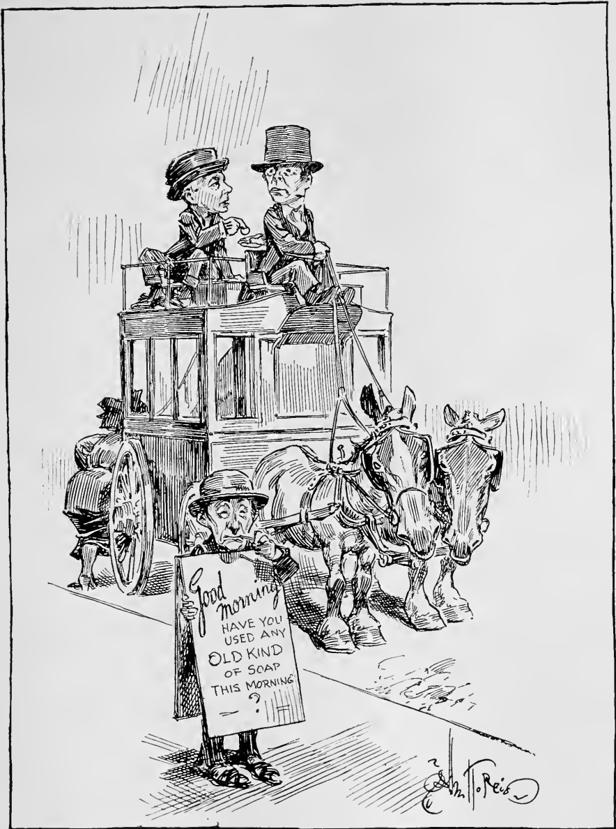
SEEING LONDON FROM THE OLD ENGLISH BUS